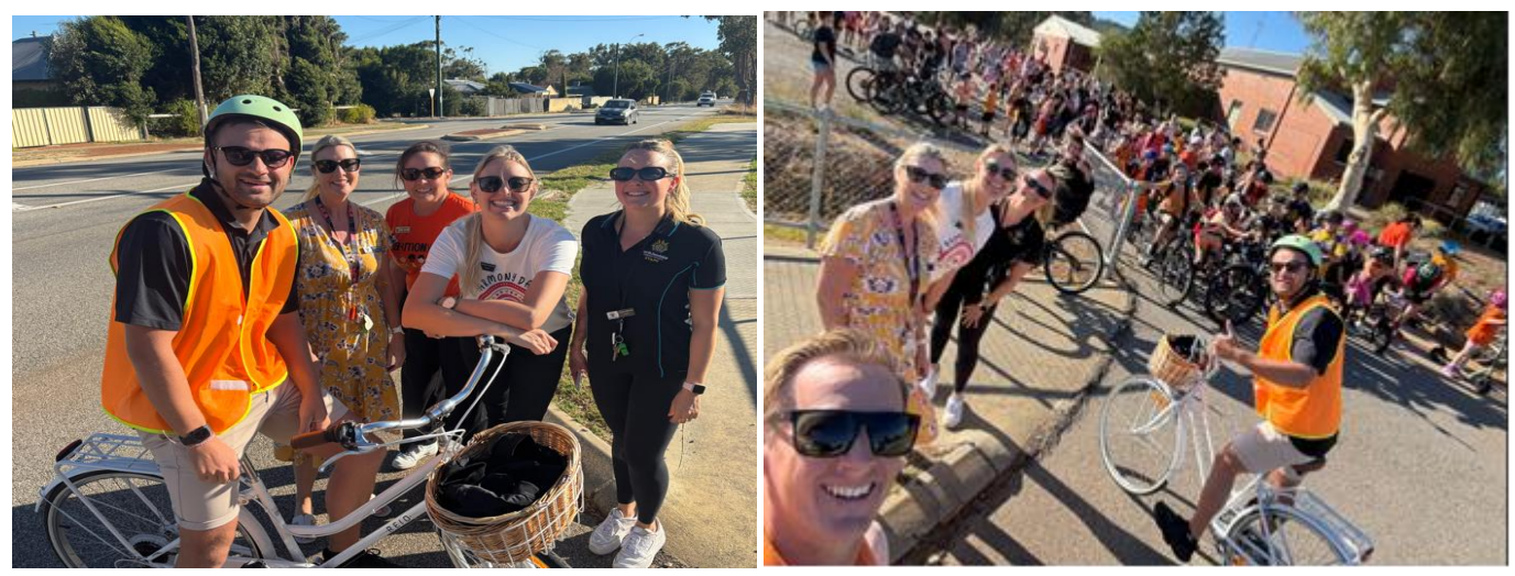
Rise and Shine, North Dandy! 😂

On Friday we had a triple barrel fun! Ride to school day, harmony day and Earth hour activities all took place. It was great fun travelling to school with many of our families. Thank you to our amazing staff who facilitated the whole day.